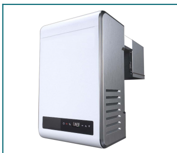
IMMAGINE INDICATIVA PRODOTTO